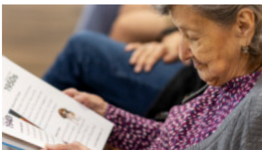
Woman reading Joyful Memories magazine.