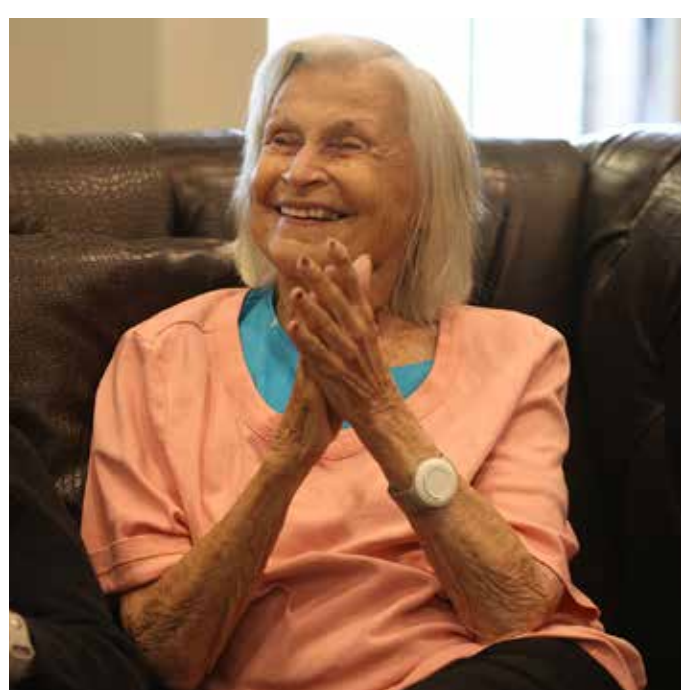
This delightful lady is always either singing along or sharing her sunny smile.