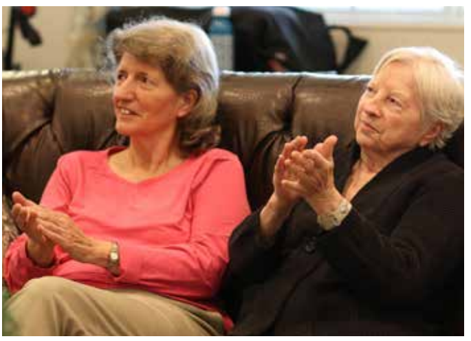
These sweet ladies always sit right up front. They love to sing, and they applaud after every song.