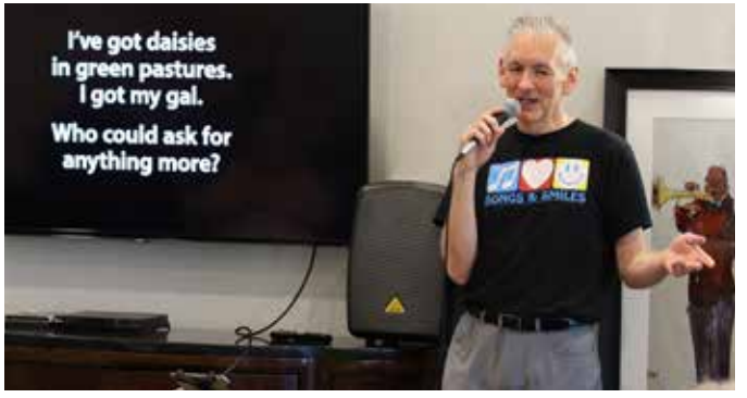
Our custom videos display easy-to-read lyrics, helping people living with dementia feel confident and secure so they can more fully enjoy the songs.